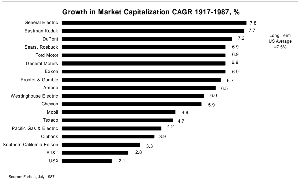
Figure 1: Of 18 Out of 100 Who Remained in Largest 100, All But Two Underperform U.S. Average Growth. Source: Foster & Kaplan, 2001, p. 8. (Proofread by AMD on 9/27/07.)